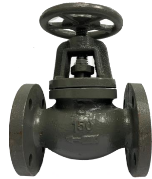
ANSI 150# Cast Iron Flange End Globe Valves