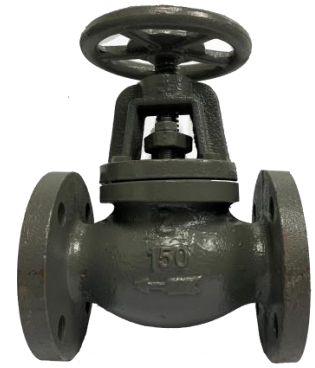
ANSI 150# Cast Iron Flange End Globe Valves